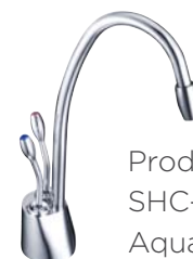
Product Code: SHC-A for Aquaboil style tap