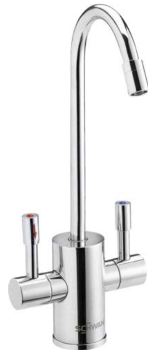
Product Code: SHC-S