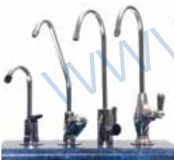
Standard, Classic, Platinum, Deluxe